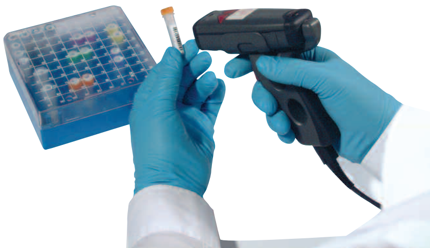
Each tube has an individual barcoded label and, when scanned, this provides all the necessary information about the sample.

Each tube has an individual barcoded label and, when scanned, this provides all the necessary information about the sample. This allows staff to identify the sample owner, check its status and discard unwanted samples, thereby freeing space. The system provides an exact location for the required sample – freezer number, shelf number, and the